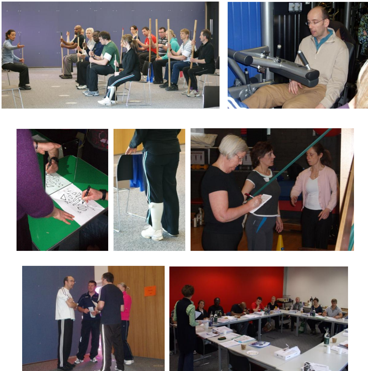
Fig. 3 The Exercise and Fitness Training after Stroke specialist instructor course. From top left: teaching workshop; tutor demonstration on gym equipment; simulation of perceptual and motor impairments; student-led teaching workshop; problem solving exercise; seminar.

validated Level 4 Specialist Instructor qualification in the UK (Fig. 3). It is also the only course that is aligned with the Curriculum Framework of the Chartered Society of Physiotherapy. This course, designed by the University of Edinburgh and Queen Margaret University, has been validated at Scottish Higher Education Level 2 (Scottish Credit and Qualifications Framework Level 8). The course is supported by all the key non-governmental organisations in this field: Chest Heart & Stroke Scotland, Northern Ireland Chest Heart & Stroke, Different Strokes and The Stroke Association.